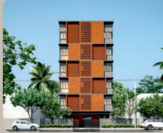
VRP Prime Heights