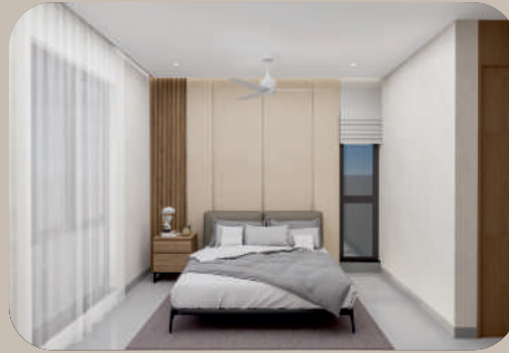
Wooden Floored Master Bedroom