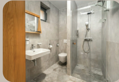
Exquisitely Designed Bathroom with Premium Fittings