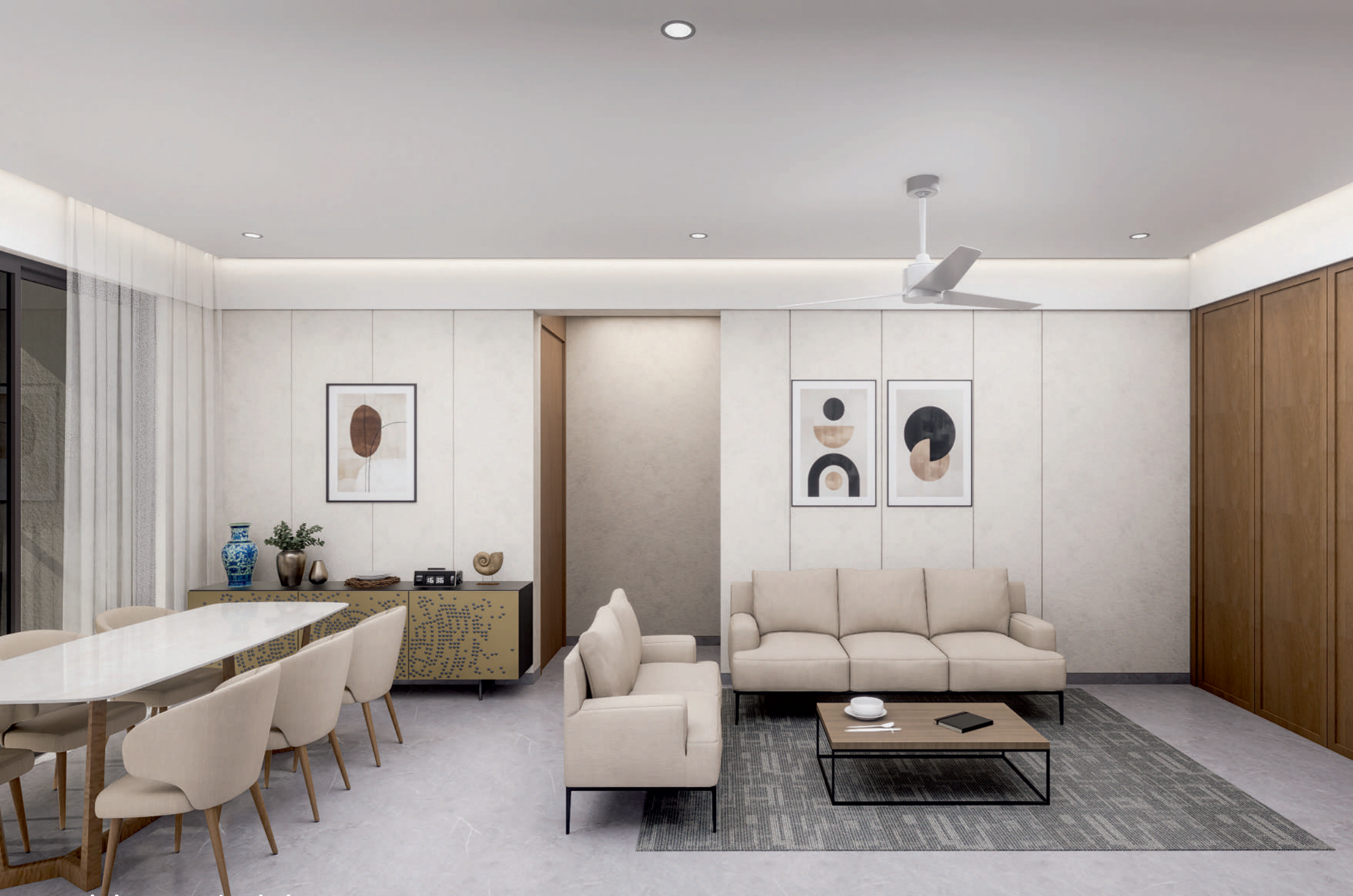
Living and Dining