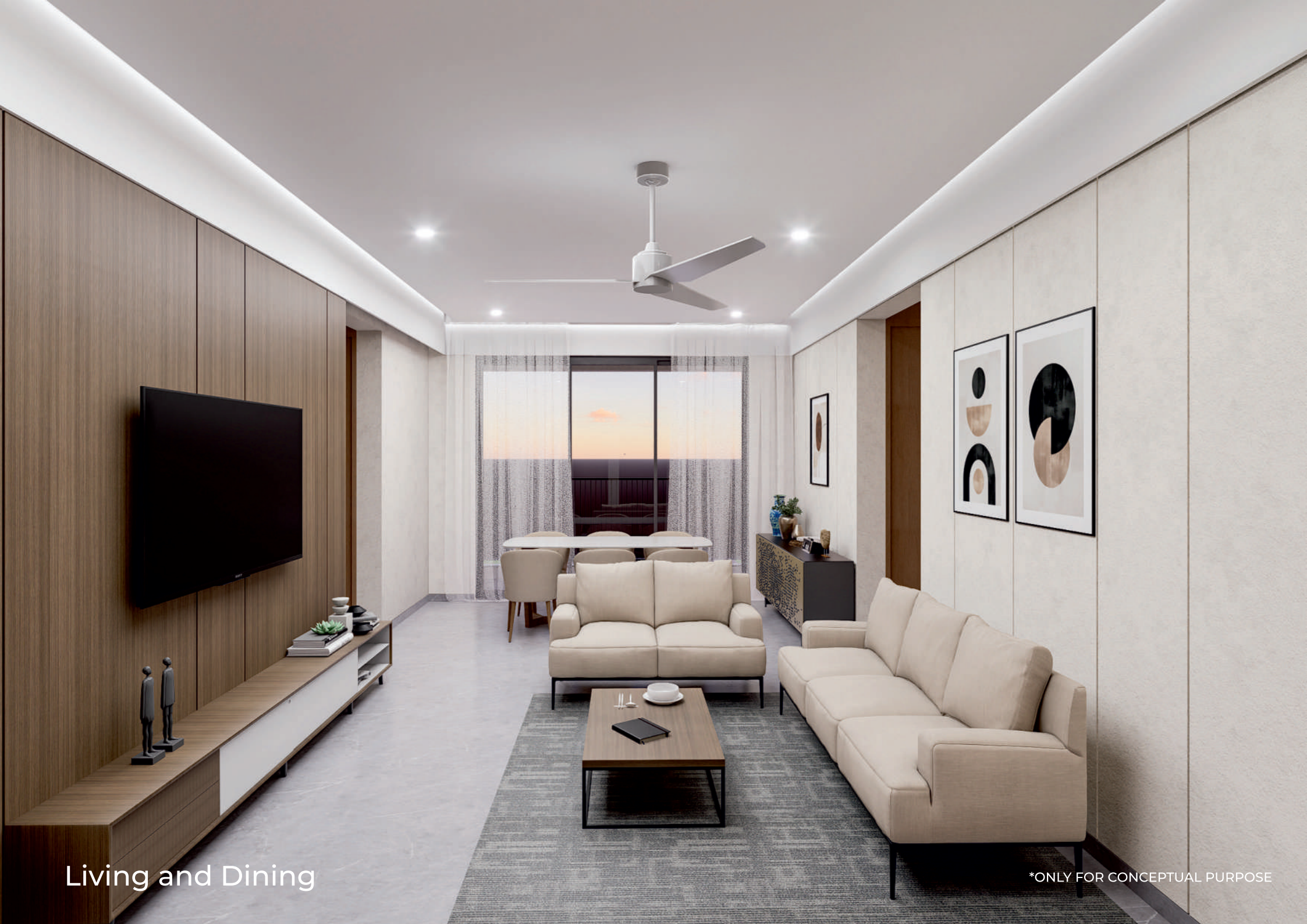
Living and Dining