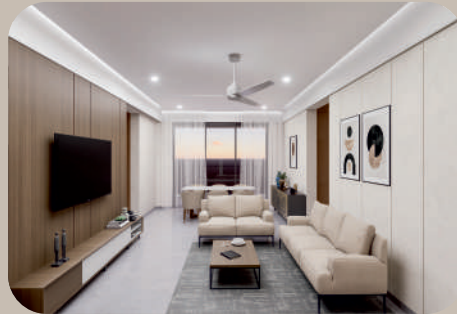
Grand Living & Dining