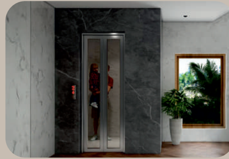
SS Body Automatic Lift