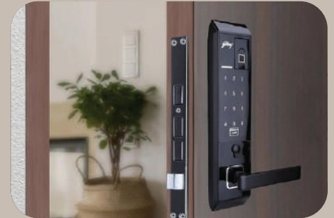
Digital Lock for Main door