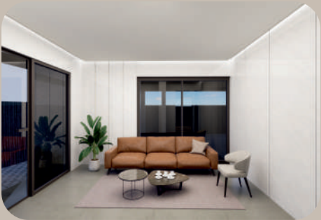
Grand Lobby with Italian Marbles